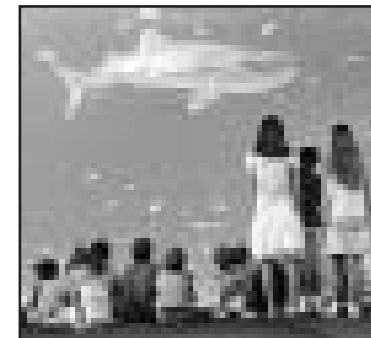
NICOLA ISEARD SCARY: Get close to the sharks

Housing more than 100,000 species, there is a rehabilitation centre for injured creatures, an area where visitors can touch horseshoe crabs and sea stars, and a cinema with special effects. Admission $22.75 (£13) adults, $17 (£10) children.