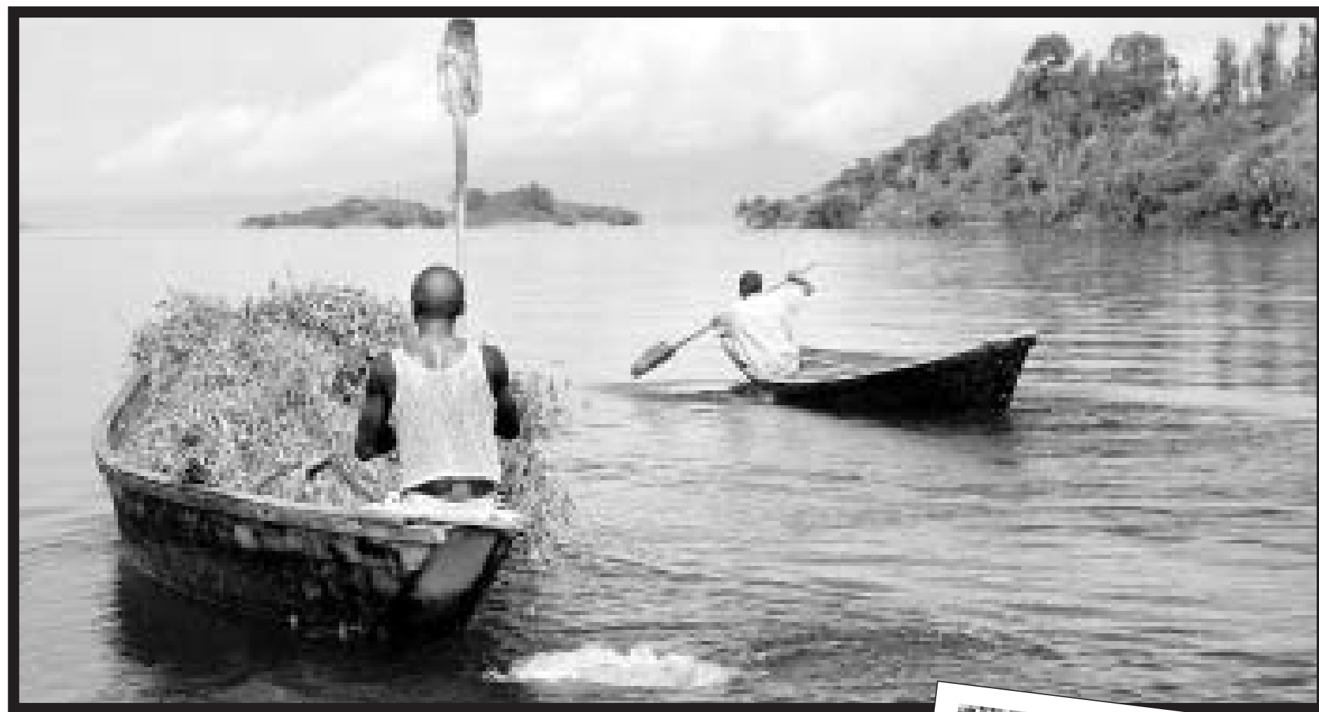
INCREDIBLE JOURNEY: Natives carry their crops across Lake Kivu in a wooden boat, left, while a two and a half hour trek into the Rwandan forest, right, brings us face to face with the gorillas. Below, Dian Fossey in 1982 with her beloved giants