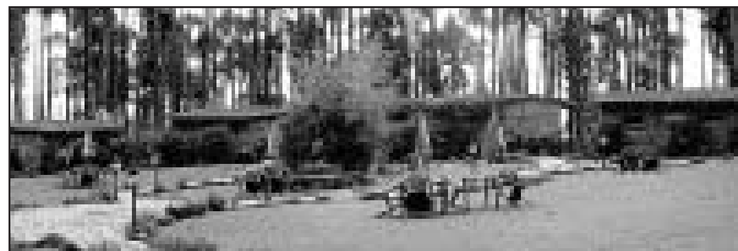
BASE CAMP: Gorilla's Nest (left) is one of the few places to stay near to the Virunga Volcanoes National Park