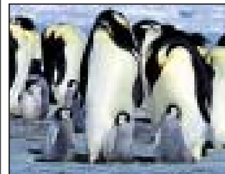
STAR TURN: P-p-p pick up a pet penguin